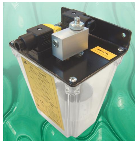
Piccola for system 33V