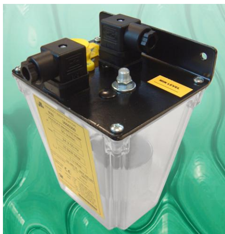
Piccola for system 01